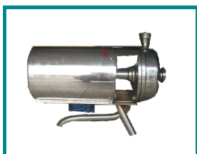
Stainless Steel Transfer Pump