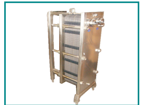
Plate Heat Exchanger