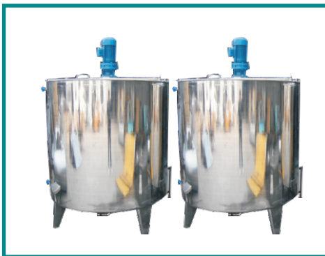
Stainless Steel Mixing tank (single layer)