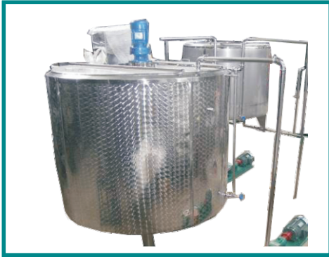
Sugar Syrup Melting Tank

OTHER EQUIPMENT WITH SHAPE BAGS FILLING MACHINE ALSO AVAIL