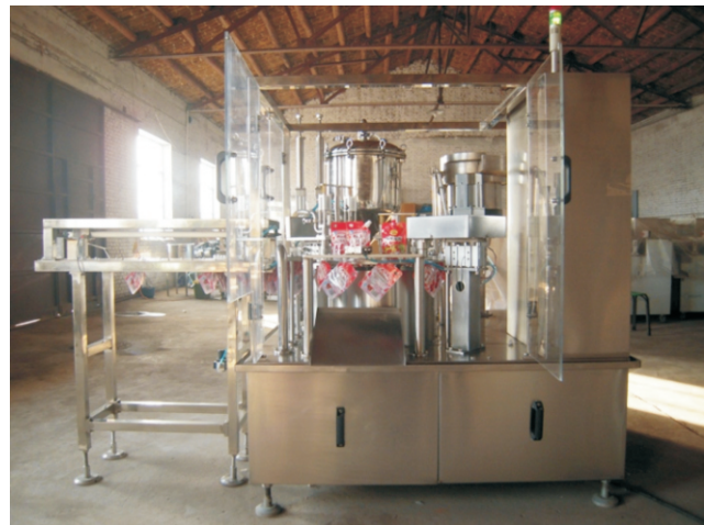
2 Filling Nozzles