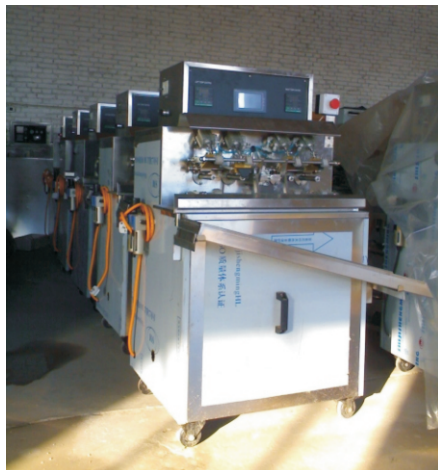
4 Filling Nozzles(Small Pump)