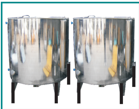
Ready Juice Tank (Height Should be 5 ft.)