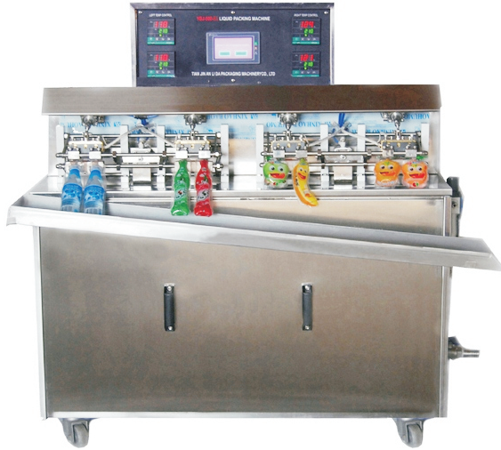
8 Filling Nozzles